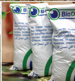
BIODEPOSIT: SAPROPEL & PEAT BASED PRODUCTS