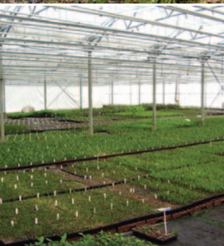
FABULOUS ASSORTMENT OF YOUNG PALMS