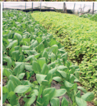
RAPID THERMOPHILIC DIGESTION TECHNOLOGY