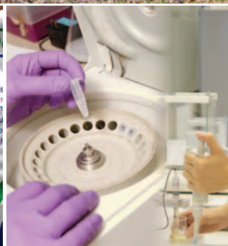
ZAGRO ANIMAL HEALTH: LEADING THE WAY