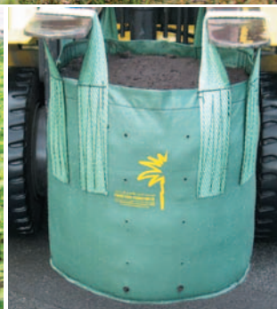
WANGARA WOVEN PLANTER BAGS